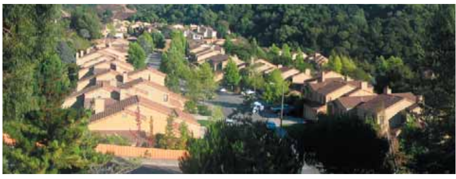
Thorup Lane seen from the big slope

September 2007 Issue Annual Meeting Thursday, Sept 27 Clubhouse 6:30 pm