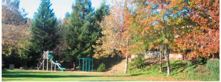
Tot lot dressed in fall colors

October 2007 Issue Thursday, Oct 25 Clubhouse 6:30 pm