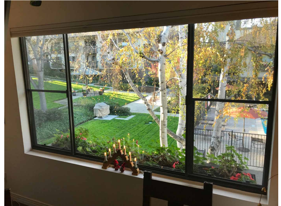
Views of and from the master bedroom.