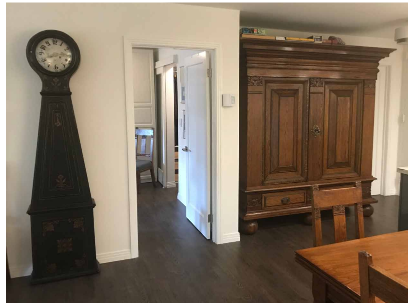
Door is entry to guest bedroom / office.