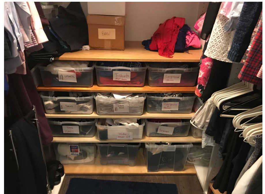
Walk-in closet features a “Chest of Drawers” five boxes wide.