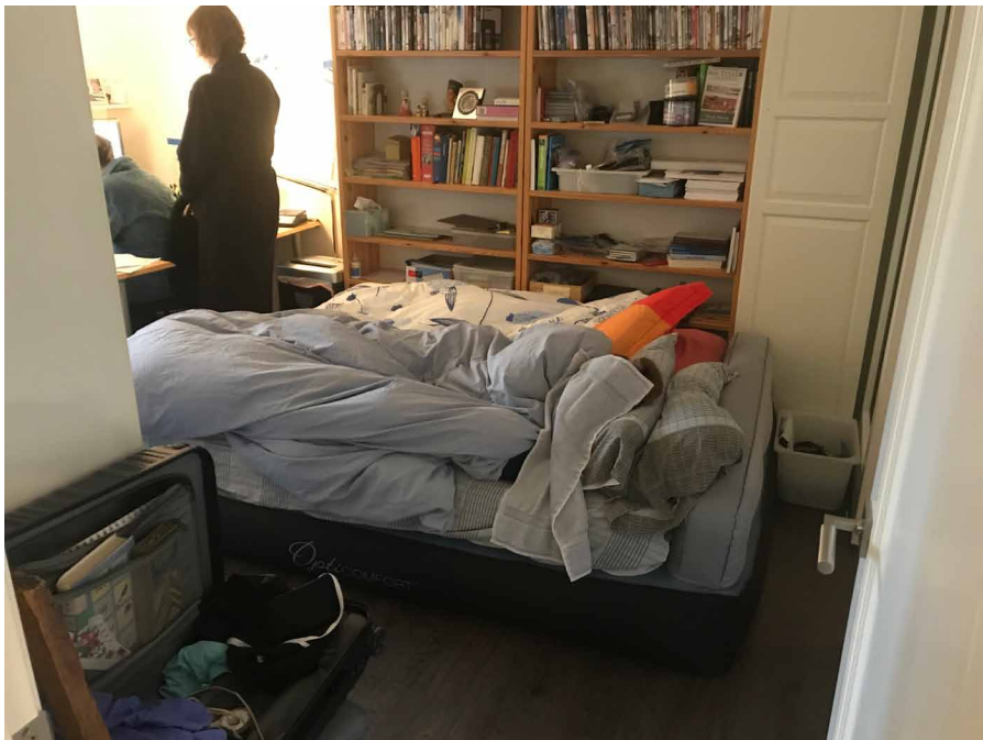
Our office has room for a queen size inflatable bed.