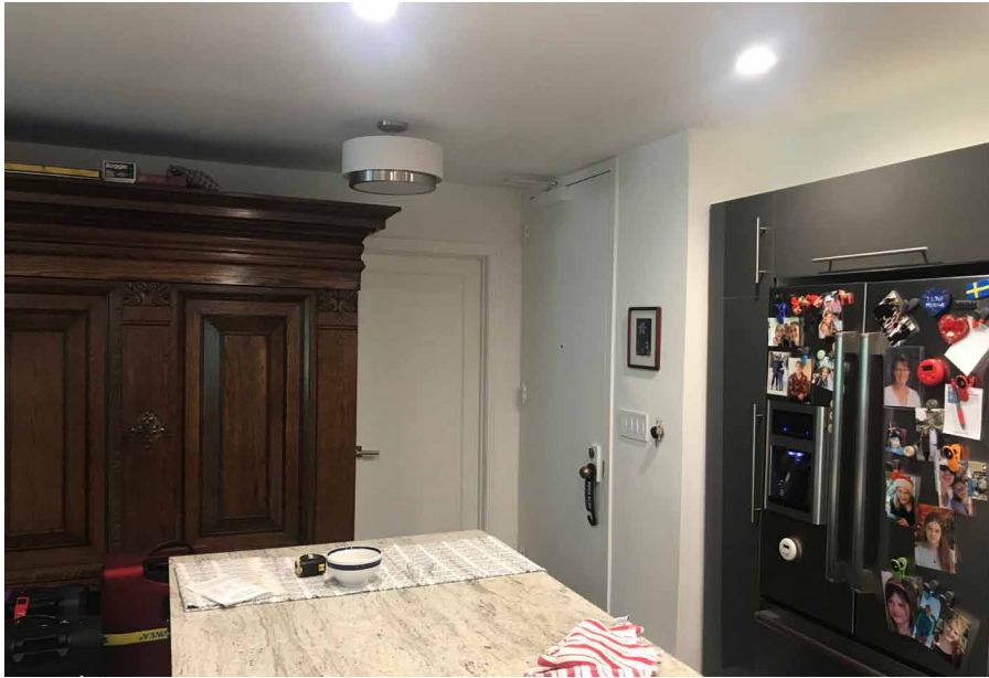
Entry to the right of corner. Door to guest bathroom to the left.