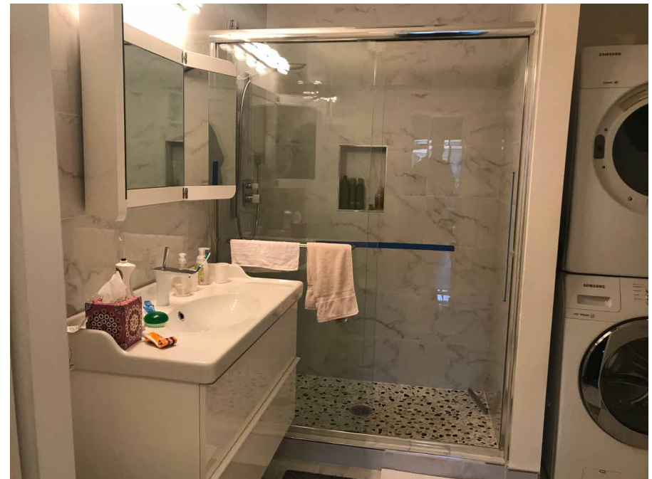
The guest bathroom is "his"