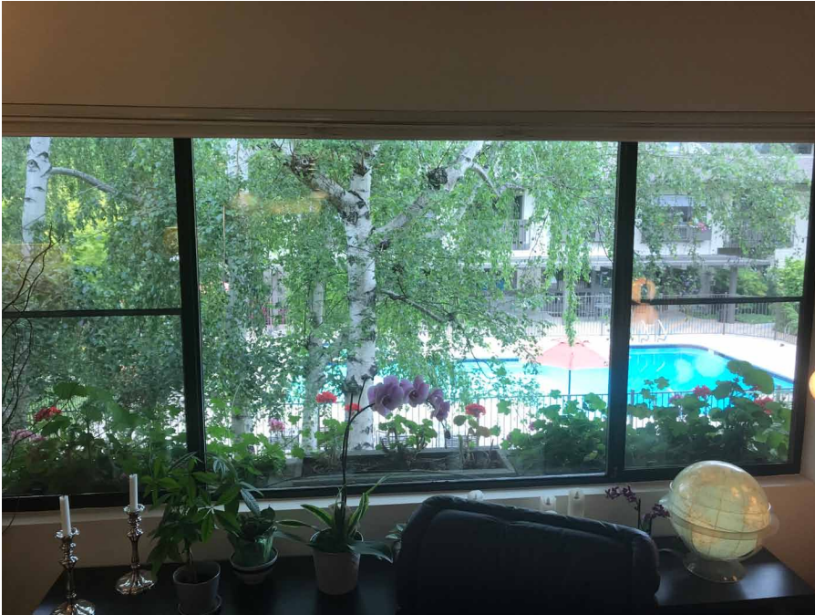
Views of and from the living room section