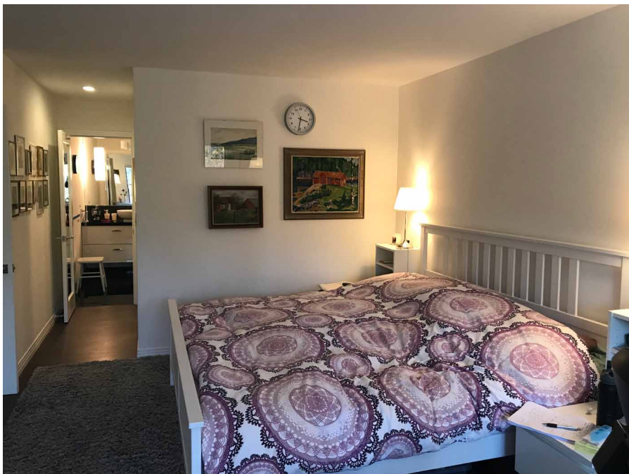
“Her” bathroom in the background.