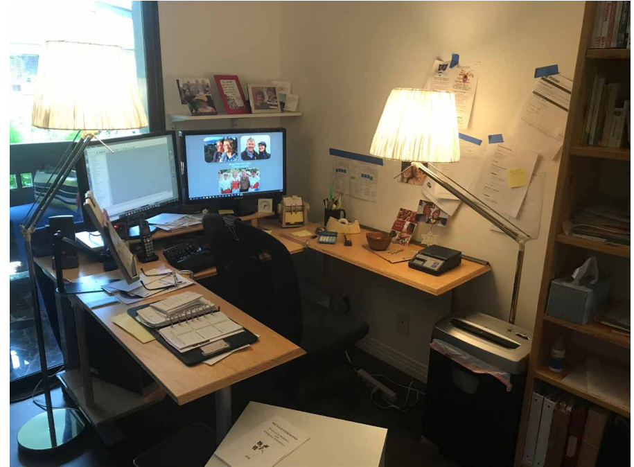
Christine's wrap-around desk and workstation.