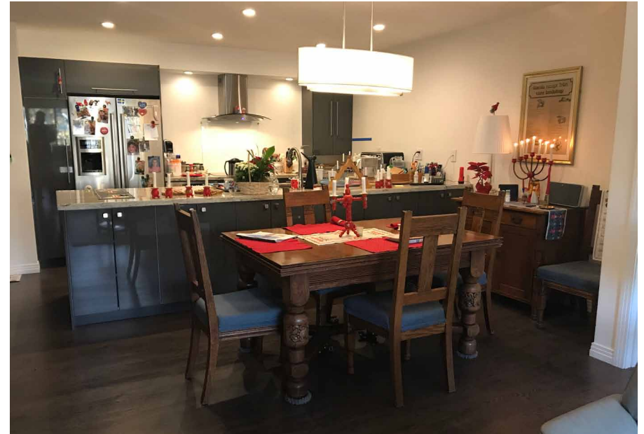
Kitchen and dining.