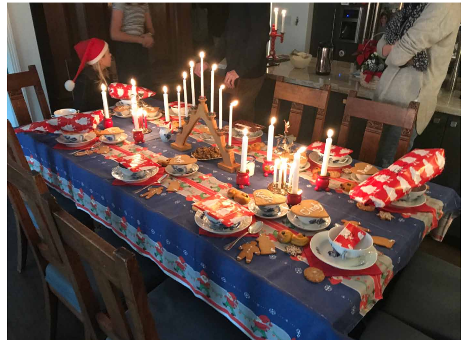
Family tradition: Cookie breakfast Christmas Eve morning.