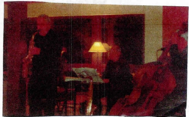
A jazz trio adds lively background music