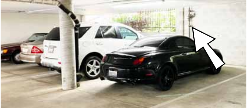
In front of garage space 208

In case of flooding in a unit, shut off water to the building.