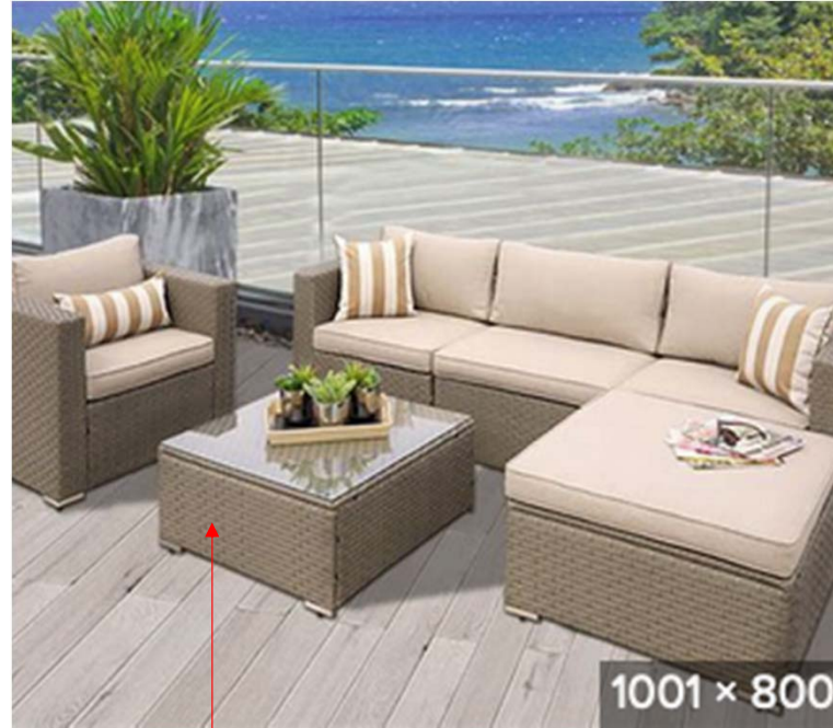
Table or fire pit (plumbed) might be nice

Firepit is a nice option for evening social time